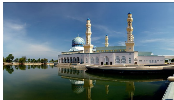
Sabah State Mosque

Explore the cultural diversity of Borneo with visits to Menara Tun Mustapha (The Sabah Foundation Building), a Chinese Temple & the Sabah State Mosque. Continue to Lok Kawi Wildlife Park – a combination of zoo and botanical garden. After lunch, transfer to Monsopiad Cultural Village for a guided tour of the village and a taste of the life of the Kadazan Dusun people, the famous head hunting tribe of Borneo. Highlights here include a cultural show and the House of Skulls.