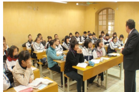
An Australian school principal addresses an English class in a public secondary school in Hanoi. Asia Literacy Vietnam Program, January 2011

The evidence suggests that academic performance can be significantly enhanced by providing young children with bi-lingual learning experiences. Within the Asian region many developing countries have taken bold steps to ensure children are educated in bi-lingual schools. The developmental benefits to these children as they become young adults in a globalised world will be quite significant.