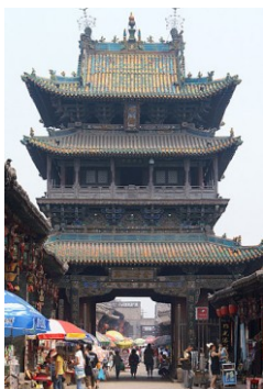
Ping Yao China's Original Financial Hub

Teachers interested in offering this program to their students should complete a Student Links Plan and indicate interest in this specific school cluster program.