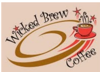
Wicked Brew Coffee

Further information: Info@AsiaLiteracy.org.au